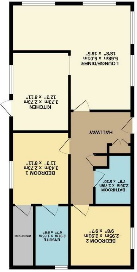
GROUND FLOOR 70.0 sq.m. (753 sq ft) approx.

TOTAL FLOOR AREA: 70.0 sq.m. (753 sq ft) approx.